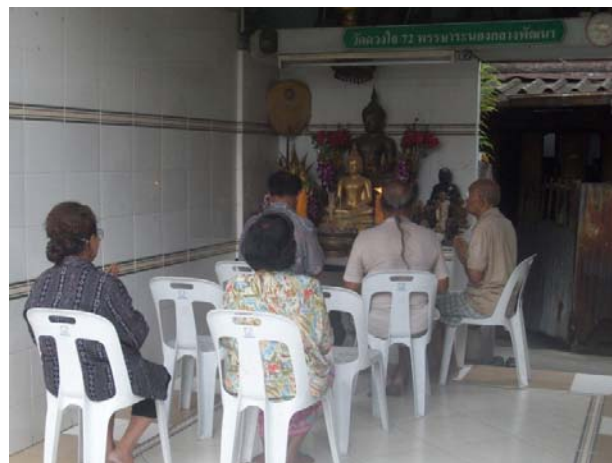
Fig. 6 Community of Committee Participation Meeting

Most people in the community are Buddhist and there is local temple called "Wat Duangjai 72 Pansa" that lacks a monk to perform religious functions and, as a result, if the members of the community want a small religious function, they need to invite a monk to perform activities. However, if it is a large religious function or particularly important day in the Buddhist calendar, they will make a trip to the nearby temple. [4]