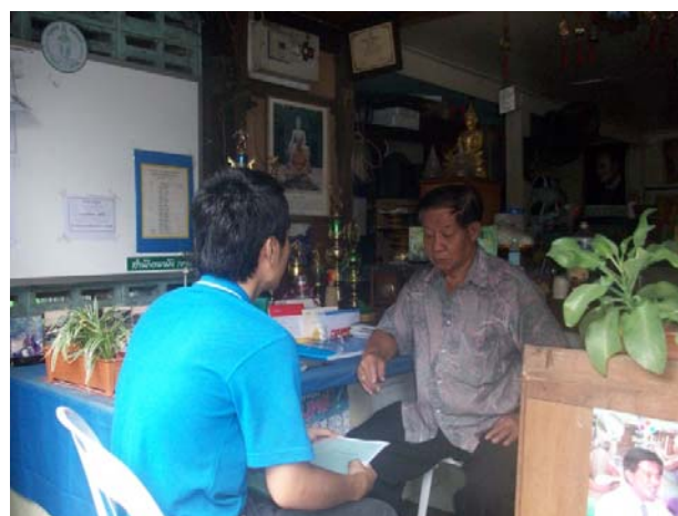
Fig. 7 Community Leader Interview

In regard to the working parents, they do not have time to teach their children the social etiquette or to give them a well-defined schedule that includes coming home at a certain time. As a result, children spend most of their time outside the house, socializing with friends (school, internet cafe, department store etc.) [5]. In conclusion, the combinations of these realities are eroding traditional Thai culture and they may be completely gone within one generation.