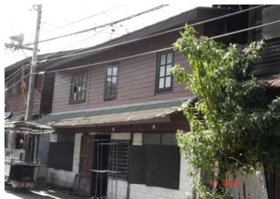
Fig. 1 Wood and mortar house (no fence)

The fence shows the better class of living and economy because they have more space and garage. The occupations of the members of these communities are various, such as laborer, company employee, government official, etc. But mostly they work outside the community, so the occupations that are left working inside the community are self-employed, low cost investment such as motorcycle-taxi, grocery stores, baby sitters, beauty salon. Their food is ordinary as most Thai people have. As a result of working outside the community, the traditional Thai culture left in the community is only on Songkran day and New Year day [2], which still have the traditional of inviting monks to perform the ceremonies and to bless for prosperity and luck of their families. [3]