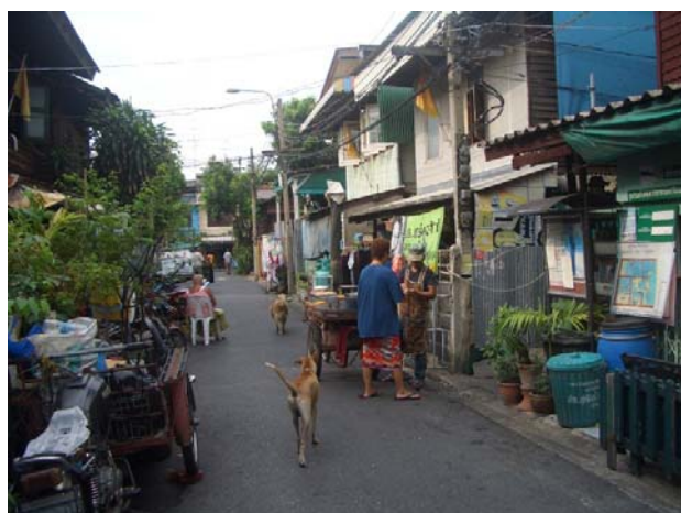
Fig. 5 Road in Community temple Ranokhang 72