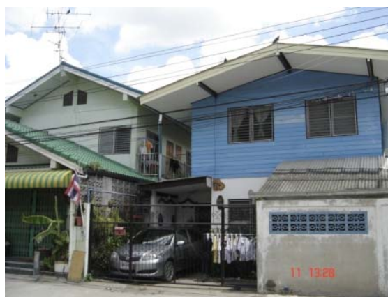
Fig. 2 Wood and mortar house (with fence)