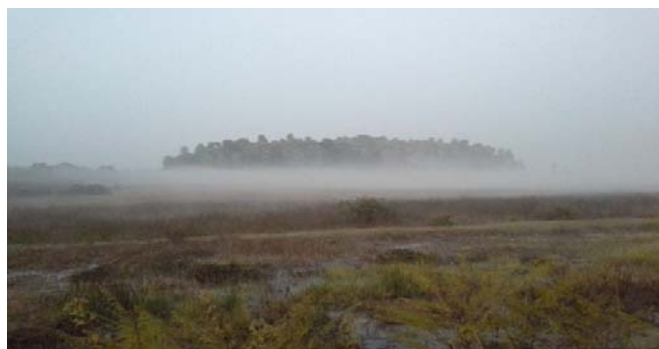
Fig. 1 Kamchanoad Forest Island

For social context, Kamchanoad is full of “Chanoad” (Livistona Saribus) which are the plants similar to palm trees or coconut trees. Chanoad is part of people’s tradition. They believe that Chanoad is sacred tree and won’t be grown anywhere except here. There is a forest called “Kam Chanoad Forest Island” a big group of Chanoad spreading throughout 20 Rais land, located on the edge of 3 villages. It is believed that this forest is the resident of Srisutto Naga. Not only Chanoad, there are many interesting plants growing inside the forest island. [4]