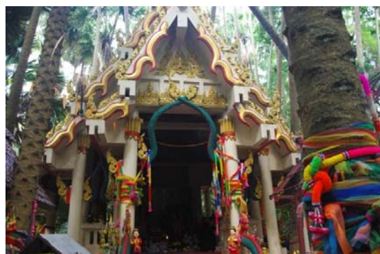
Fig. 3 Grand Srisutto Shrine