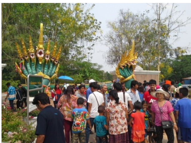
Fig. 5 People celebrating Songkran in Kamchanoad

Tourism management is the common awareness of people in Kamchanoad. They have experienced the boom of tourism in their region and earned a lot of income during special events where domestic and international tourists come to visit the town. Below are pictures displaying the lively activities during Songkran Festival in Kamchanoad.