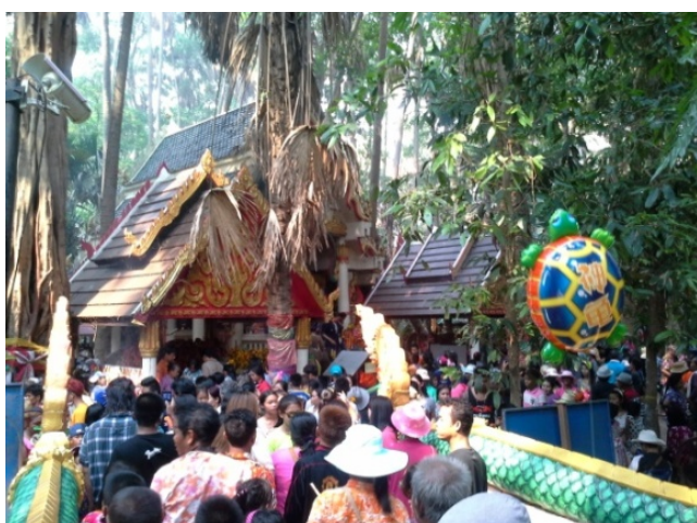
Fig. 6 People went to The Grand Srisutto Shrine for Blessing

From the study, it reflects that the tourism businesses here are owned by local people. 95% of sellers during special seasons are local people. They designed the business style and