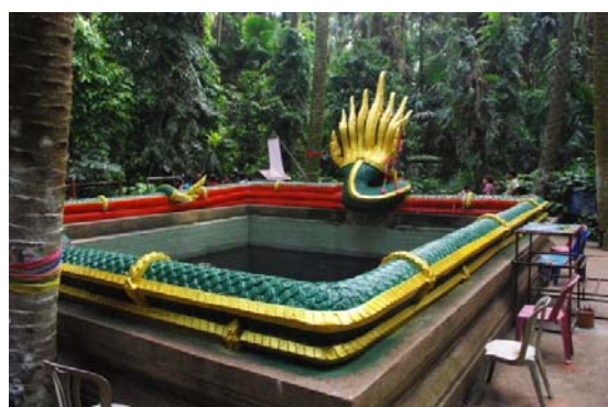
Fig. 4 The Sacred Well

Kamchanoad is the land of Naga. The island forest of Chanoad is believed as the resident of Srisutto Nag, one of the biggest Naga goddess in the mythology. Story from the myth said that Kamchanoad is not only the resident of Srisutto, it is also the entrance to the underworld. Srisutto was the creator of Mae Khong River, the big river in north-east of Thailand. From the myth, Srisutto Naga and his friend, Suwannak Naga was fighting against each other for 7 years. Their conflict affected all three worlds, so Indra stopped them, separated them to live at another end of Dong Payafai land, and let them compete by building. Who finish first will win the prize of Pangasianodon gigas. Finally, Srisutto won the competition by creating Mae Khong River while Suwannak built Nan River. The myth explained why Pangasianodon gigas can only be found in Mae Khong River. Srisutto also asked Indra to build