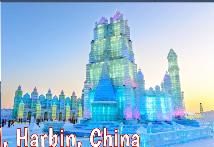
Ice & Snow Festival, Harbin, China